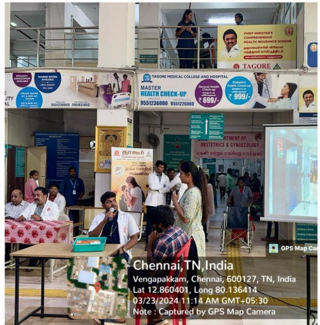
Chennai, TN, India Vengapakkam, Chennai, 600127, TN, India Lat 12.860401, Long 80.136414 03/23/2024 11:14 AM GMT+05:30 Note : Captured by GPS Map Camera