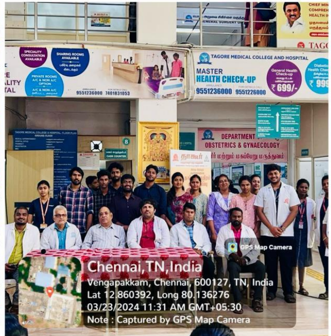
Chennai, TN, India Vengapakkam, Chennai, 600127, TN, India Lat 12.860392, Long 80.136276 03/23/2024 11:31 AM GMT+05:30 Note : Captured by GPS Map Camera