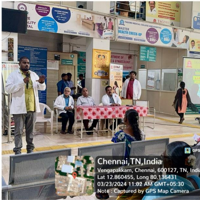
Chennai, TN, India Vengapakkam, Chennai, 600127, TN, India Lat 12.860455, Long 80.136431 03/23/2024 11:02 AM GMT+05:30 Note : Captured by GPS Map Camera