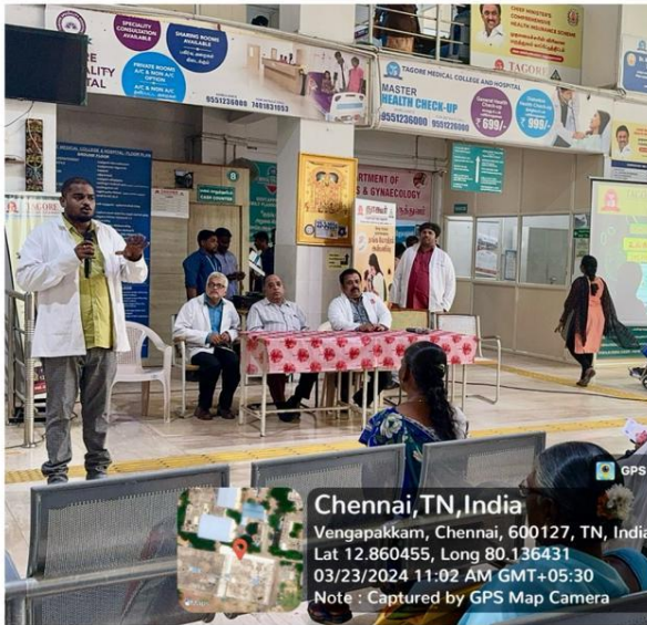
Chennai, TN, India Vengapakkam, Chennai, 600127, TN, India Lat 12.860455, Long 80.136431 03/23/2024 11:02 AM GMT+05:30 Note : Captured by GPS Map Camera