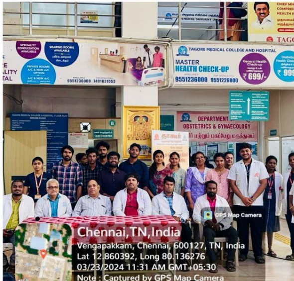
Chennai, TN, India Vengapakkam, Chennai, 600127, TN, India Lat 12.860392, Long 80.136276 03/23/2024 11:31 AM GMT+05:30