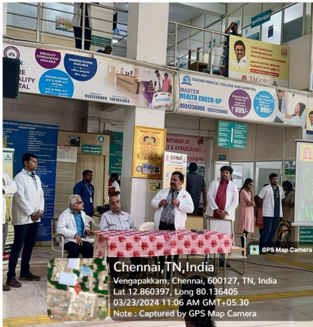
Chennai, TN, India Vengapakkam, Chennai, 600127, TN, India Lat 12.860397, Long 80.136405 03/23/2024 11:06 AM GMT+05:30 Note : Captured by GPS Map Camera

(Affiliated to the Tamil Nadu Dr.MGR Medical University & Recognized by the Ministry of Health & Family welfare. Govt. of India New Delhi)