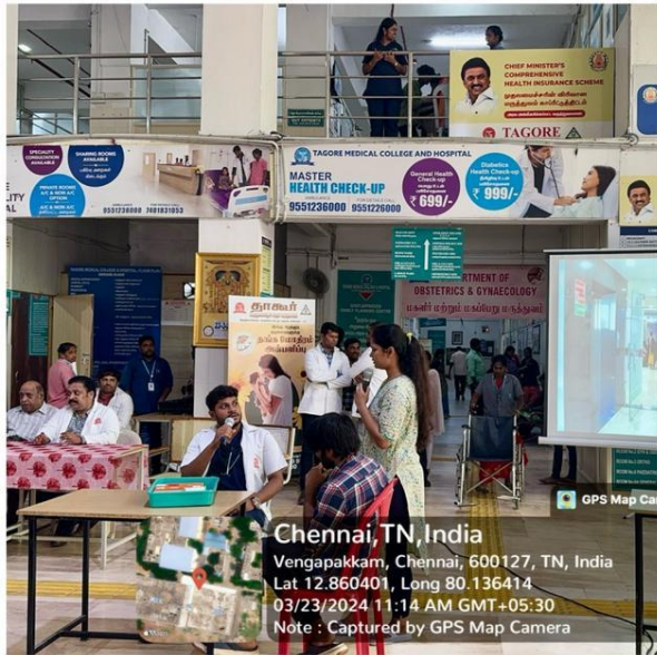
Chennai, TN, India Vengapakkam, Chennai, 600127, TN, India Lat 12.860401, Long 80.136414 03/23/2024 11:14 AM GMT+05:30 Note : Captured by GPS Map Camera